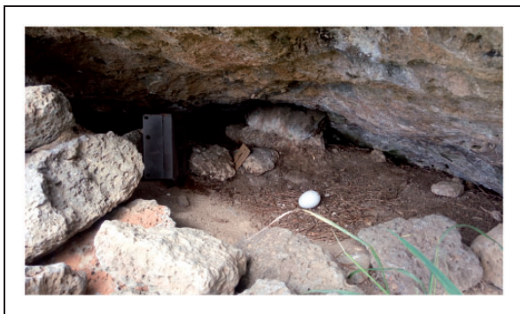
Figure 2. One of the empty red-tailed tropicbird nests at Rano Raraku used in this study showing an experimental egg and a Bushnell Camera Trap.

were empty but recently used as confirmed by the presence of feces, down, and feathers (personal observation). On November 20, 2016, three hen eggs of free-living birds raised at Rano Raraku were placed in three of the empty nests (one egg per nest). Each experimental egg was monitored by a Bushnell Camera Trap settled in each nest to record the visits and behavior of potential predators (Figure 2). The following day, nests were checked in the morning and evening to attempt to determine diurnal and nocturnal predators. None of the eggs were depredated. After each inspection, eggs and cameras were changed to other nests. On the second day, the same procedure was performed. Again, none of the eggs were depredated. Therefore, on the third day, eggs and cameras were