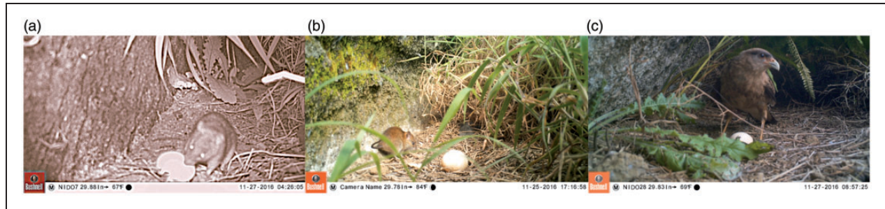
Figure 3. Potential predators recorded visiting simulated unattended eggs in nests of the red-tailed tropicbird, Phaethon rubricauda . (a) Brown rat Rattus norvegicus , (b) Polynesian rat Rattus exulans , and (c) Chimango Caracara Phalcooenus chimango .